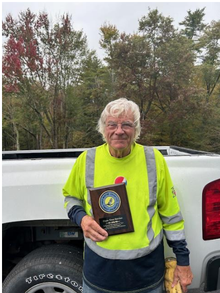
PWTU AWARD TO CRUM TREE SERVICE