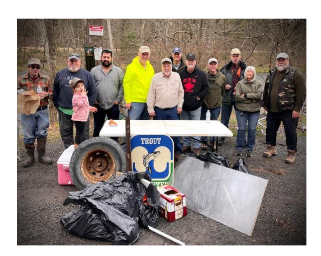
APRIL 14TH, 2024 RIVER CLEANUP.

PEOPLE SAY EACH YEAR WE ARE FINDING LESS AND LESS REFUSE ALONG THE RIVER...A GOOD SIGN!