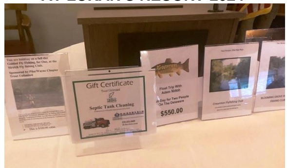
SOME OF THE BANQUET PRIZES