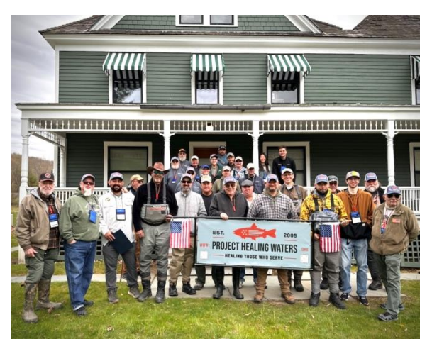
APRIL 27TH-PROJECT HEALING WATERS-ZANE GREY MUSEUM