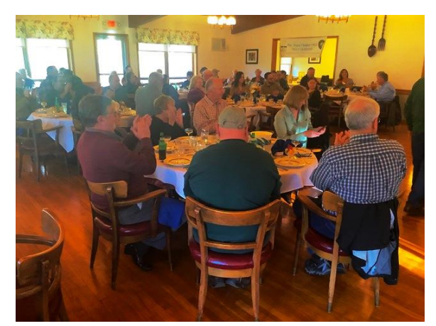
PWTU BANQUET AND FUND-RAISER AT LUKAN'S RESORT-2024