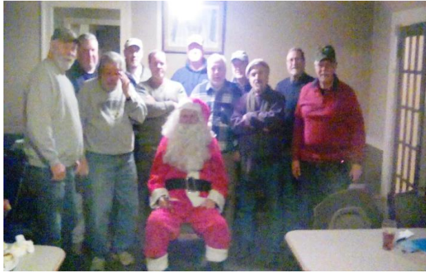
2022 CHRISTMAS PARTY AT CORA'S. WHO PLAYED SANTA?